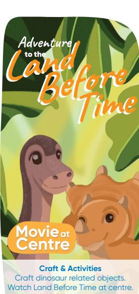
Wednesday 9th October