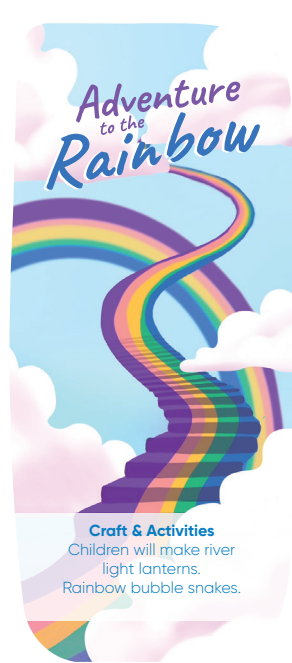
Tuesday 1st October