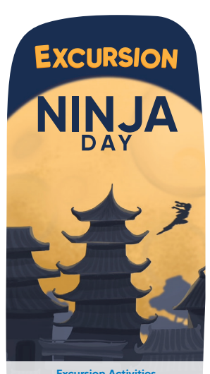
Craft & Activities at Centre Create Ninja craft & Ninja yoga.