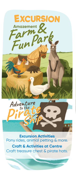
Tuesday 8th October