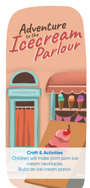
Monday 30th September