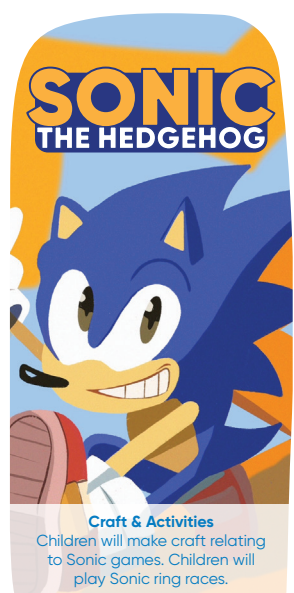
Friday 4th October