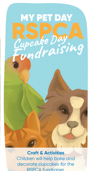
Friday 11th October