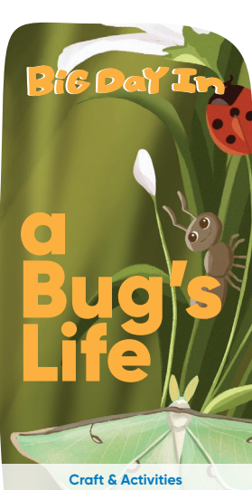
Insectarium Incursion. Explore the wonderful world of insects though craft & activities